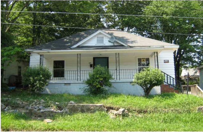
Good condition for the price. MAKE AN OFFER!!!